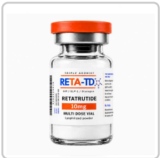
GLP-3 RT 10mg - RT0001