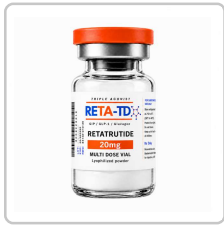
GLP-3 RT 20mg - RT0002

Identity: GLP-3 RT Peptide Purity: 99.65%