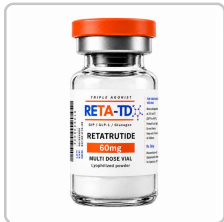
GLP-3 RT 60mg - RT0078